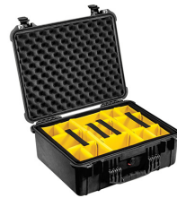
1554 With Padded Dividers