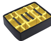
1555 Padded Divider Set