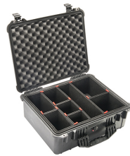
1550TP With TrekPak Divider System