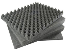
1551 4 pc. Replacement Foam Set