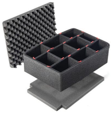
1550TPKIT TrekPak Case Divider Kit