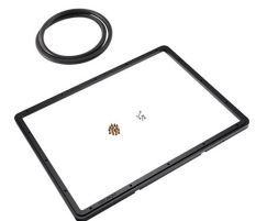
1550PF Special Application Panel Frame