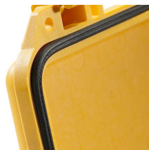
1553 Replacement O-ring