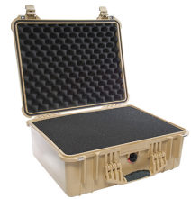
1550WF With Foam